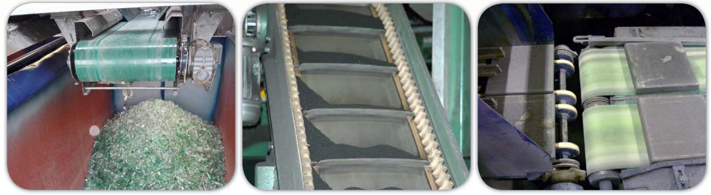
FRPZ - 6 Glass recycling