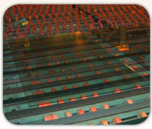
FRGZ - 5 Glass conveying