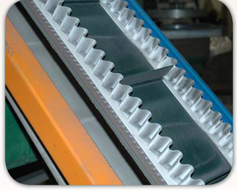
FEZ - 3.2 Industrial chemical conveyor