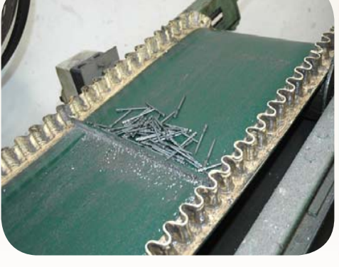
FEZ - 3.2 Nails production